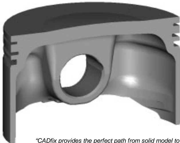
"CADfix provides the perfect path from solid model to FE mesh"